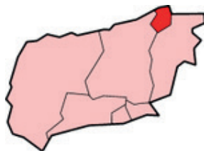
Shown within West Sussex